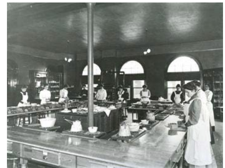
Domestic Science Class 1906