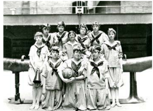
Girls Championship Basketball Team, 1919

The Deans of Women also continually worked on promoting more dormitories and facilities for women. "The girls of the university under the direction of the Women's Council have conducted a splendid campaign.