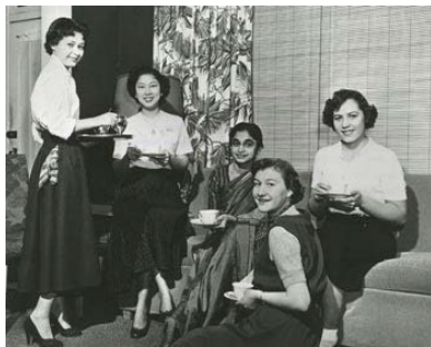
International Students at Zonta House, 1952

The Women's Self-Government Association, which replaced the Women's Council, provided the most important opportunity for extracurricular enrichment for women students in terms of leadership and organizing skills. All women belonged to the WSGA which had an executive committee and a system of self-government in each dormitory.