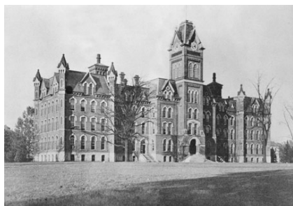
University Hall 1873

The Ohio State University opened its doors in 1873. The university's enabling act provided that it was to be open "to all persons over 14 years of age." At this time in U.S. history, women could not vote, in many states could not own property, and genuinely were second class citizens. They were expected to marry and have children. Education typically was not a high priority. 1