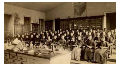
Chemistry Class 1888