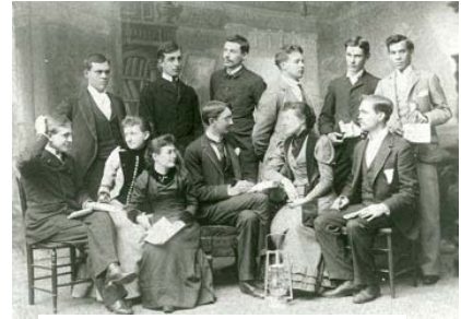
Lantern Staff 1892